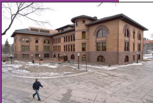
Operating out of the newly-renovated Nicholson Hall on the University of Minnesota campus, our teachers and students now have easy access to a nook for conferencing, a state-of-the-art computer lab, and a classroom space for presenting sample lessons.

Minnesota Writing Project University of Minnesota 10 Nicholson Hall 216 Pillsbury Drive SE Minneapolis, MN 55455